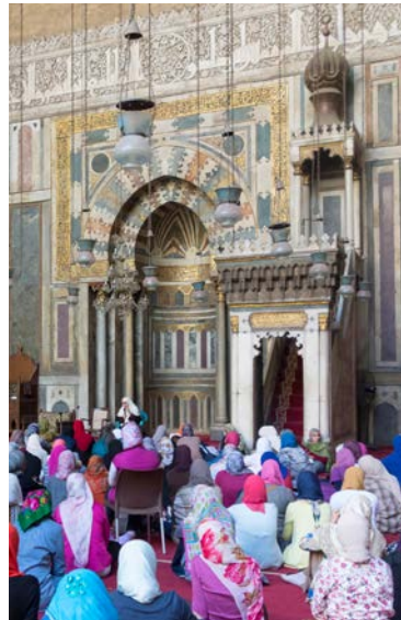
Muslims attend a sermon at a mosque in Cairo.

About ninety percent of Egyptians are Muslim and follow the religion of Islam . Nearly ten percent follow Christian religions. Christianity was the main religion of Egyptians before Islam spread to the region around AD 640.