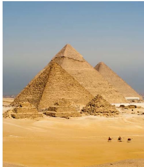
The Pyramids of Giza are southwest of Cairo.

Romans, Arabs, and Turks occupied Egypt. Near Cairo are the Pyramids of Giza, the monuments of ancient Egypt's pharaohs (FEHR-ohz). Modern western-style hotels line the Nile.