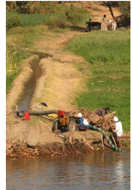
Egyptian farmers use hoses to pump water into canals to irrigate their crops.

More than eighty-six million people live in Egypt. Many of Egypt's cities and towns are located along the Nile, which runs through the eastern part of the country. Because the rest of the country is mainly desert, a large majority of Egyptians live near the Nile. People use ground water for cooking, washing, and drinking, and they use river water for irrigating crops.